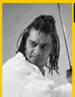
SETE TELE (WA) CHINA