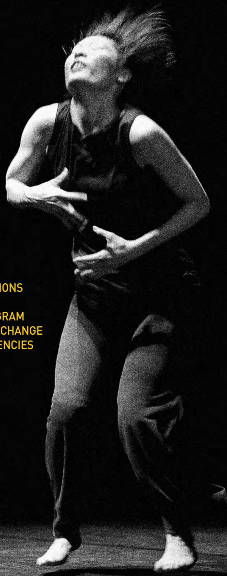
Image: Niche/Japan 2002 a work by Sue Healey produced by Aichi Arts Centre